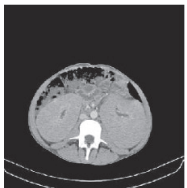
Figure 1. Computed tomographical examination revealed bilateral diffuse renal enlargement without any functional abnormality. There was no detectable focal lesion in the both kidney.

Because there was no response to iron supplementation on the 15th day of the treatment, the patient has referred to our hospital. He had a significant pallor, tachycardia (130/min) and a few petechiael eruptions on the lower extremities. His blood pressure was 130/80 mmHg. He had an enlarged liver and spleen both palpable 5 cm below the costal margin at the midclavicular line. The kidneys were bilaterally palpated as two solid tumor masses with smooth surface engaging the whole abdomen. There was no evidence of lymphadenopathy. The results of the complete blood count were as follows: hemoglobin 2.9 g/dl, mean corpuscular volume (MCV): 62 fl, white blood cell count 4,2x 109/l, and platelet count 60 x 109/l. A peripheral blood smear revealed 80% lymphocyte, 2% monocyte and 18% neutrophil with inadequate platelets. Urine microscopy revealed no haematuria and there was no detectable proteinuria. Serum biochemistry, coagulation parameters (prothrombin time, activated partial thromboplastin time and fibrinogen level), vitamin B12, and folic acid levels were in the normal range except for elevated serum creatinine (1.4 mg/dl), uric asit (12 mg/dl), LDH (1100 U/L) levels. These elevated values returned to normal ranges after the treatment following anti-cancer chemotherapy (serum creatininine:0.9 mg/ dl, uric acit: 3.3 mg/dl, LDH: 514 U/L). Serological tests